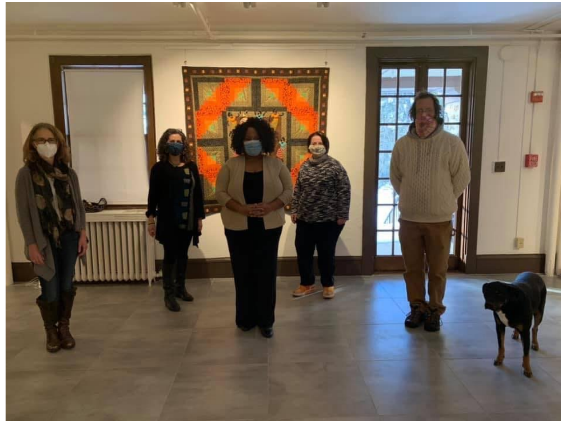
BETHANY ARTS COMMUNITY, OSSINING