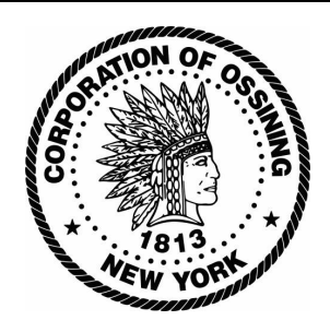
VICTORIA GEARITY Mayor